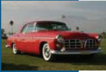
1955 Chrysler 300