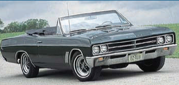
1967 Buick Gran Sport