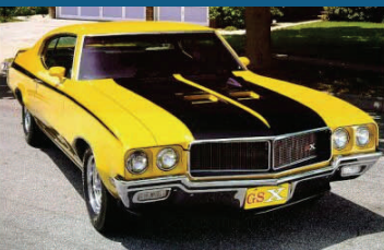
1970 Buick GS455 Stage 1

Like Chevrolet, Buick also entered the great American muscle car race mid-year in 1965, in this case with a rather regal Gran-Sport. The plan was simple, place a not-so small engine in a not so big car. Their choice was the Skylark an upscale Special named after the flashy convertible Buick had rolled off a Motorama stage into regular production in 1953. Neither the Skylark or special were well suited for high-performance applications in the beginning, but that all changed in 1963 when Buick’s classy compact graduated into GM’s newly formed intermediate ranks. They dropped the unit-body construction and replaced it with a full-frame foundation that would accommodate the horses.