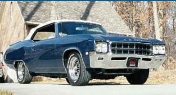
1969 Buick Gran Sport