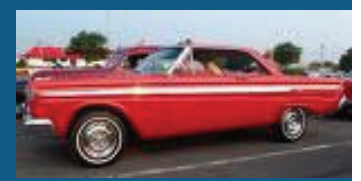
1964 Mercury Comet