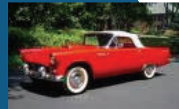
1955 Ford Thunderbird