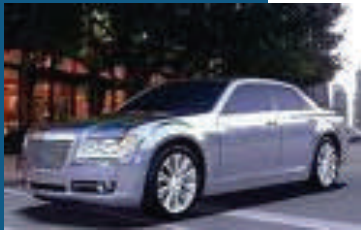
2011 Chrysler 300