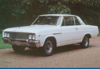
1965 Buick Gran Sport