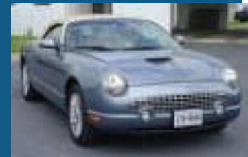
2005 Ford Thunderbird