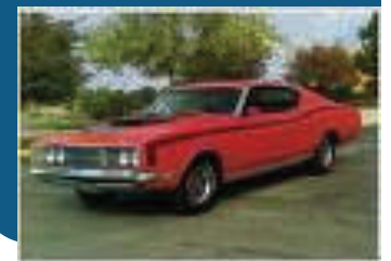
1972 Mercury Cyclone